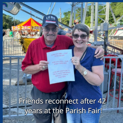
Friends reconnect after 42 years at the Parish Fair!